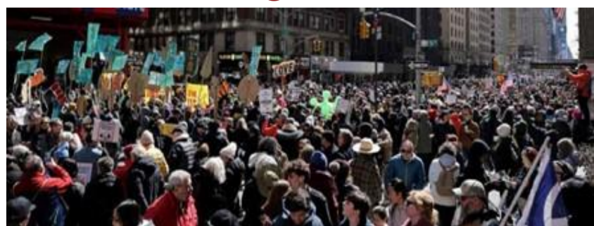
New York demonstration - One of the thousands 'No Kings' rallies sweeping USA